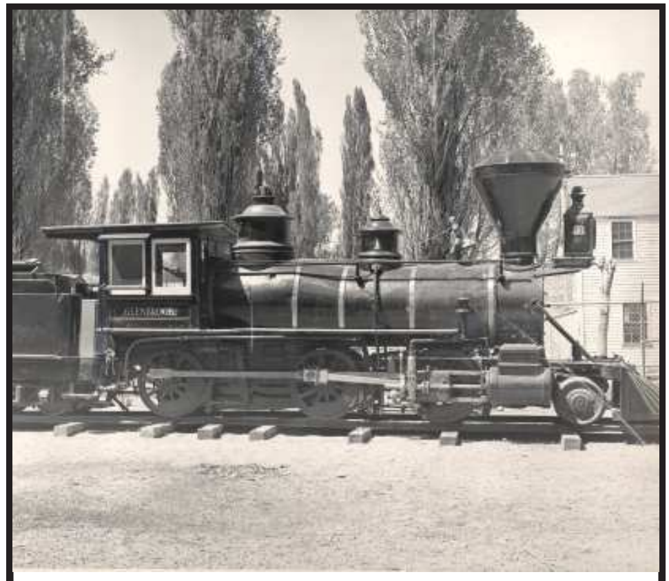
Glenbrook at the Nevada State Museum