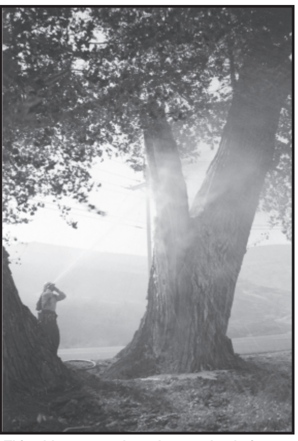
This old tree was the only casualty during the July 14th fire (see story on page 8).