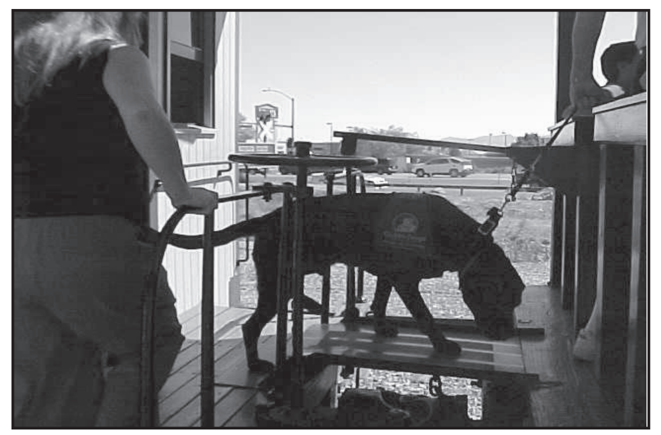
Guide dogs training at the museum during the August 14th steam-up.