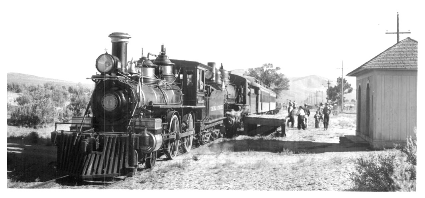
V&T No. 11 , Reno, at Stewart shelter, 1949.

This article is based on the author's presentation for the 35th Nevada Railroad History Symposium, held at Carson City October 19-22, 2006.