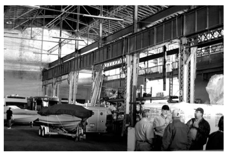
Scenes from the Symposium bus tour, October 22: inside former SP Sparks erecting shop (above), Archeology of the ReTRAC project on display in the Reno Amtrak station (below).