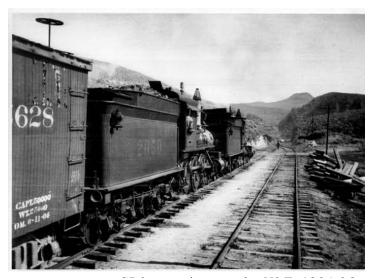
SP locomotives on the V&T, 1904-06.

It was another period of expansion and expansive thinking. SP was holding 499 freight cars for the V&T at Reno, Sparks, Truckee, and Verdi. Another 100 cars were on the V&T plus 25 in the yard at Mound House. All 624 carloads awaited transshipment to the C&C. After a considerable lean period, the V&T had resumed quarterly dividends of $37,500 and was even renting two SP ten-wheelers, Nos. 2038 and 2050, at $10 a day to help handle the increased business.