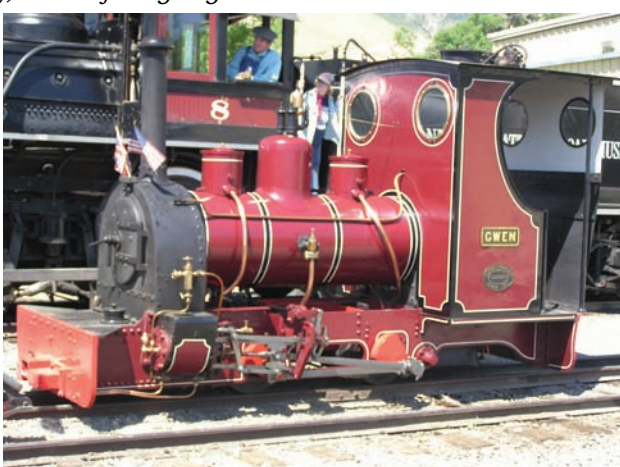
Eighteen-inch gauge Gwen (front and NSRM Volunteer Todd Moore in the cab of No. 8.