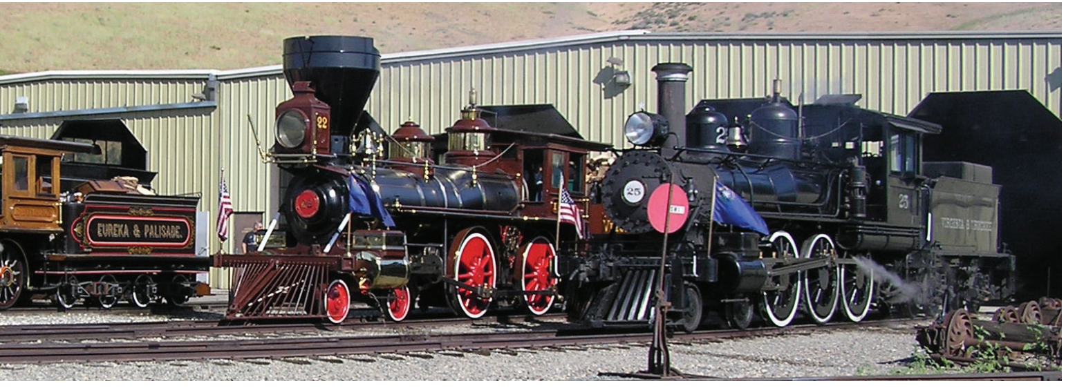
Denver, Texas & Fort Worth Railroad No. 9); Three-foot gauge Eureka & Palisade Railroad 2, Inyo; and V&T No. 25 outside the