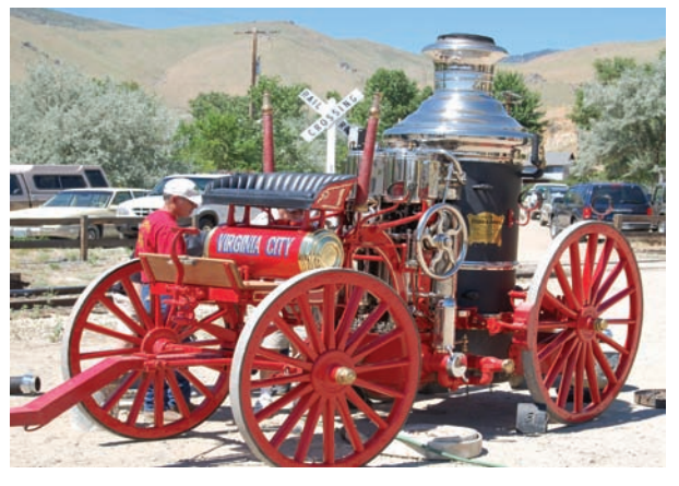
Virginia City's Liberty Engine Company steam fire pumper.