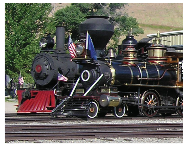
Above, left to right) NSRM locomotive No. 8 (originally No. 4, Eureka; Virginia & Truckee Railroad No. 22 Museum Annex on Saturday, July 1 before the Parade of Steam Locomotives.