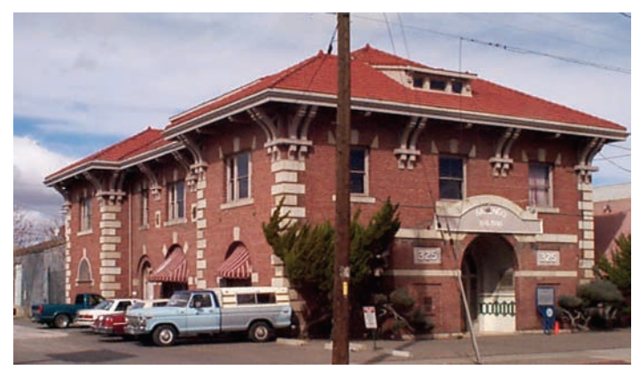
Nevada-California-Oregon Railway Depot, 325 East Fourth Street, Reno. This structure was built in 1910. It served the Western Pacific Railroad after 1917. Until 1937 it was WP's Reno station. Later it housed railroad offices. WP sold it in 1975.

Go to www.nevadaculture.org and click on "State Historic Preservation Office"; "Historic Registers"; "Nevada Entries in the National Register of Historic Places"; and the name of the County you want to see. Among the railroad-related National Register properties in Nevada are five locomotives, two railroad cars, eight railroad depots and a turntable.