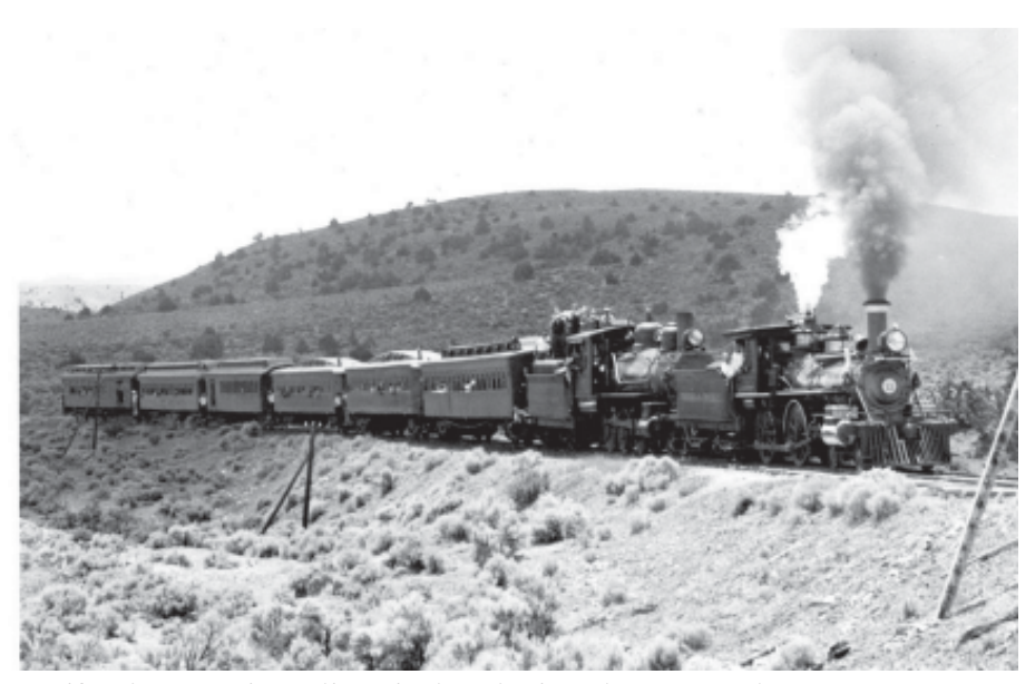
Calfornia-Nevada Railroad Historical Society excursion, June 5, 1938; approaching Mound House enroute to Virginia City.

In 1940 America began building tens of thousands of new locomotives, steam and diesel, and considerably more rolling stock in support of the worldwide war effort. America's Class I Railroads became accustomed to moving enlisted men and draftees to training camps throughout the U.S. They also moved soldiers to ports of embarkation and ensured a continuous flow of military and other supplies for America and its allies. Motor vehicles played a minor role on the home front during WW II compared with the railroads. According to the Association of American Railroads, 97 percent of military personnel and ninety percent of all freight involved in the U.S. war effort moved by rail. Rationing of gasoline and rubber threw onto railroads more passengers than many of them could handle. How did the War affect short lines like the V&T? Let's consider what was happening year-by-year on the V&T for a couple of years before, during, and immediately after the War.