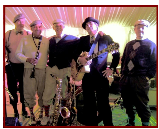
Lucky Diamond & the Gents O' Jive Performing at NSRM, August 12!

Impromptu on the Rails Friday, August 19 4:00 - 6:00 pm