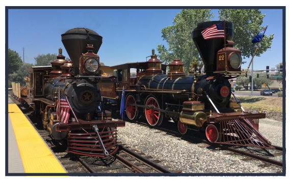
The Two Beauties - Glenbrook & Inyo Steamed Up

For the third year in a row the museum offered an all-inclusive wristband for sale. For $15 each day, adults received admission to the museum and unlimited train rides aboard No. 25 and the McKeen Car. On